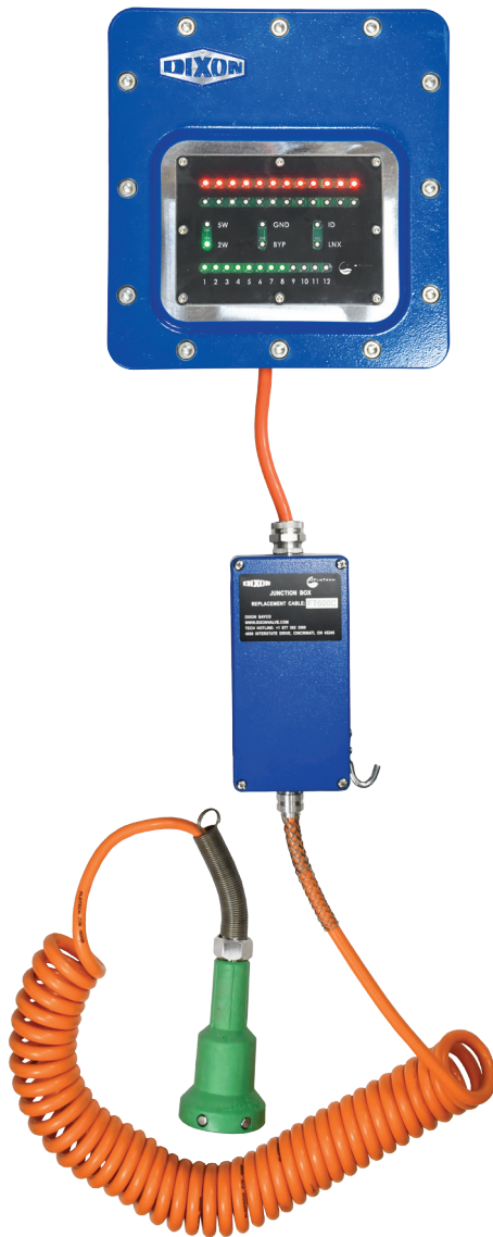
Rack Monitor System